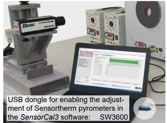
USB dongle for enabling the adjustment of Sensortherm pyrometers in the SensorCal3 software: SW3600

Wiring-Box: Power supply with pyrometer / PC connection cables, e.g. for the warm-up time of additional pyrometers under test. Fully assembled according to specifications.